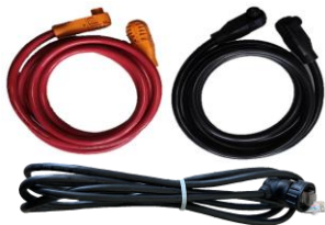
Model: RW-M6.1-BCable Details: Pair of 4AWG Battery power cable and RJ45 communication cable for battery parallel, both ends have waterproof terminals . The cable length can be customized based on customer requirements, default length is 600mm .