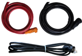
Model: RW-M6.1-PCable Details: Pair of 4AWG DC power cable and RJ45 communication cable connect with hybrid inverter, one end has a waterproof terminal . The cable length can be customized based on customer requirements, default length is 1500mm.